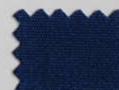
Marine 314 414