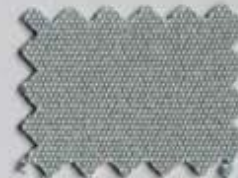
Silver Grey 314 941