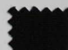
Black 314 154