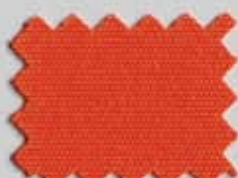
Burnt Orange 314 005