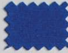
Dark Blue 314 006