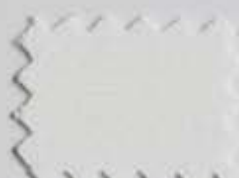
White 314 010