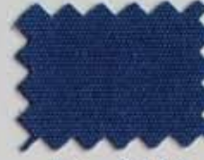
Marine 314 414