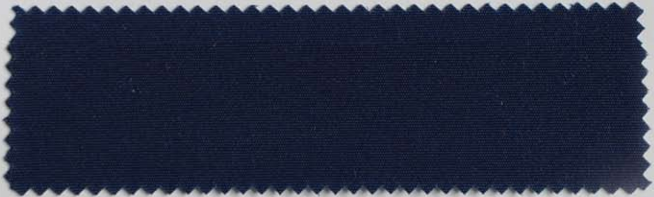
Admiral Blue 314D88 205cm only