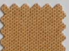
Canyon 364 570