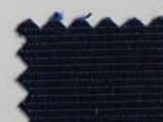
Midnight Blue 314 271