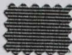
Charcoal Tweed 314 402