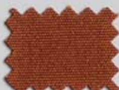
Brown 314 013