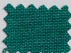
Green 364 592