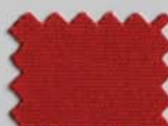
Burnt Red 314 347