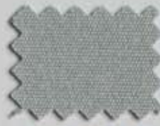
Silver Grey 314 941