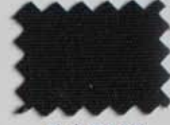
Black 314 154