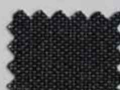
Graphite 364 638