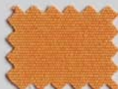
Ochre 314 008