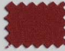
Bordeaux 314 763