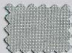
Pewter 314 364