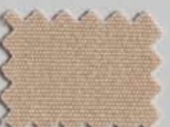
Sand 314 020