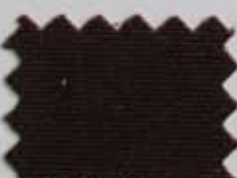
Chocolate 314 016