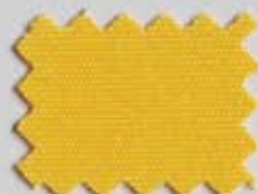
Yellow 314 003