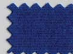
Dark Blue 314 006