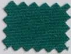
Fir Green 314 362