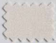
Ecru 314 325