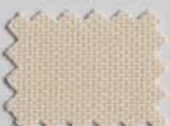
Sandstone 314 814