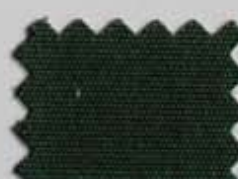
Reseda 314 009