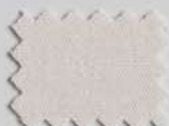
Ecru 314 325