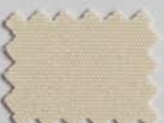
Champagne 314 851