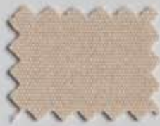
Sand 314 020