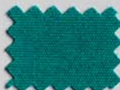
Light Green 314 004