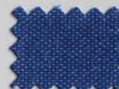
Ultra Marine 364 568