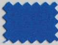
Royal Blue 314 011