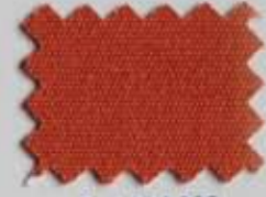
Rust 314 022