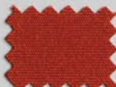
Rust 314 022