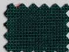
Greenstone 314 257