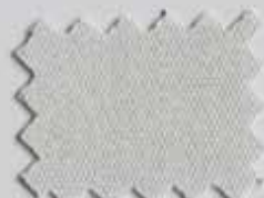
Silk Grey 314 030