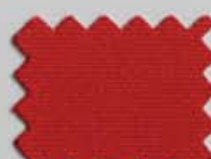
Dark Red 314 001