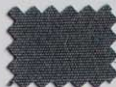
Slate Grey 314 398