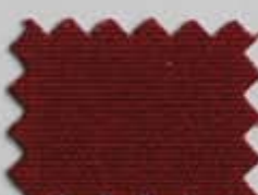
Bordeaux 314 763