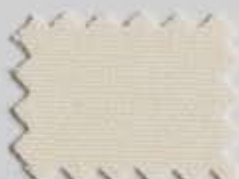
Cream 314 033