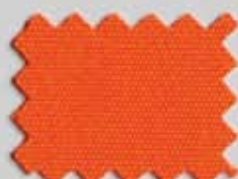
Orange 314 002