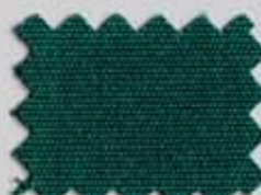
Fir Green 314 362