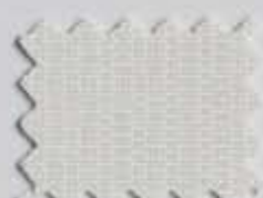
Mist Grey 314 723