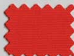
Red 314 007