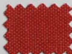
Granite 364 569