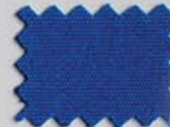
Royal Blue 314 011